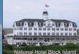
National Hotel Block Island